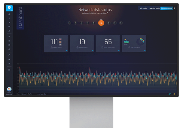
Radiflow iSID's dashboard, displaying the network's security status

As each plant incorporated multiple subnets, an instance of Radiflow's iSAP Smart Collector was installed on each subnet to send a mirrored stream of all TCP/IP data traffic to the local iSID. And while sending such volumes of data over the plant's LAN would typically overload the network, iSAP's proprietary filtering and compression algorithms are able to greatly reduce data volume, saving the need to make changes to the customer's LAN.